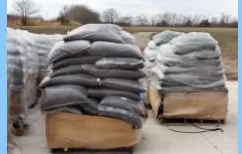
(Pictured above: Scrap tire material has been delivered to the trail site! Now we wait for the ground to dry in order for our contractor to apply the material.)